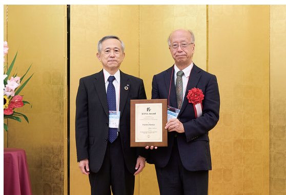
At the KONA Award presentation ceremony, President Yoshio Hosokawa (Left) and 2022 KONA Awardee Prof. Hidehiro Kamiya (Tokyo Univ. of Agriculture and Technology, Japan).

Utilizing fine particles and microcapsules measuring larger than 100 nm in diameter, he investigated the original molecular design of polymer structures on particles and capsules to characterize and control surface interaction via colloid probe AFM. In the gas phase, the adhesion of fine ash particles at high temperatures hindered the stable operation of various energy systems. Hence, he developed original systems for characterizing the particle adhesion force and shear strength of single ash at high temperatures based on a split-type tensile strength tester. Since real ash includes various chemical elements, he developed a model of ash particles prepared from pure silica as well as other metal oxide fine particles, with the addition of alkali metal or phosphorus. Based on the fundamental characterization method and ash model, he investigated the mechanism of increasing ash particles generated from different plant and fuel sources. To control the adhesion behavior of ash, he proposed the addition of alumina and other inorganic nanoparticles. The characterization,